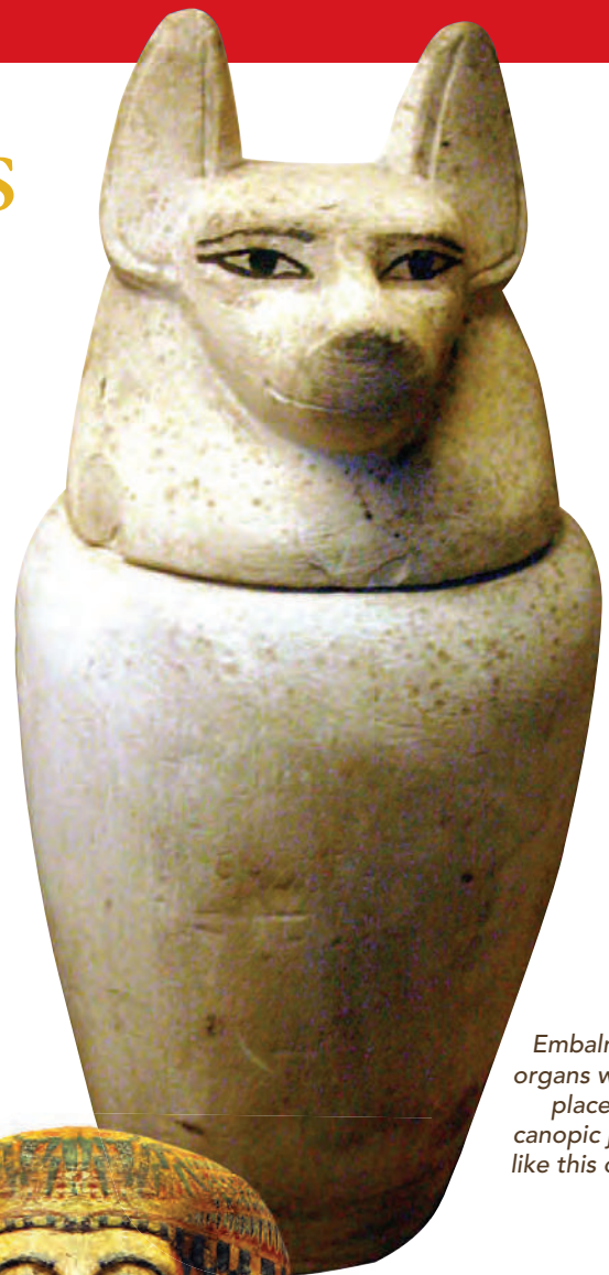
Embalmed organs were placed in canopic jars, like this one.