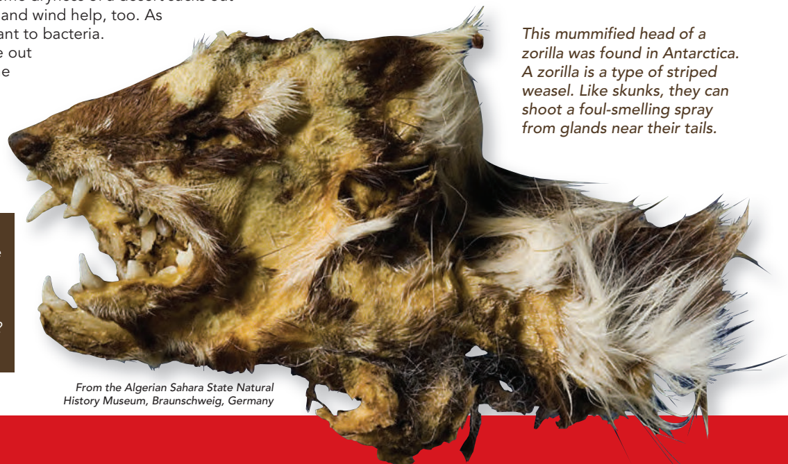
This mummified head of a zorilla was found in Antarctica. A zorilla is a type of striped weasel. Like skunks, they can shoot a foul-smelling spray from glands near their tails.

Not every body that is left or dies in a cave becomes a mummy, but corpses in dry caves in desert regions have the best chance of being preserved.