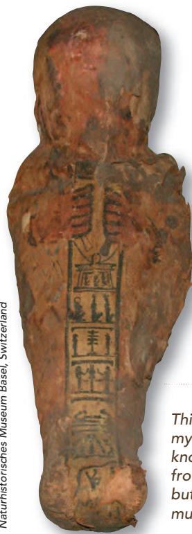
Naturhistorisches Museum Basel, Switzerland