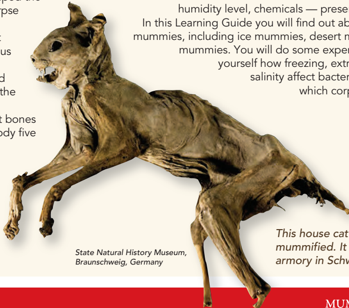
State Natural History Museum, Braunschweig, Germany

In this Learning Guide you will find out about some natural mummies, including ice mummies, desert mummies and salt mummies. You will do some experiments to see for yourself how freezing, extreme dryness and salinity affect bacteria and the rate at which corpses decompose.